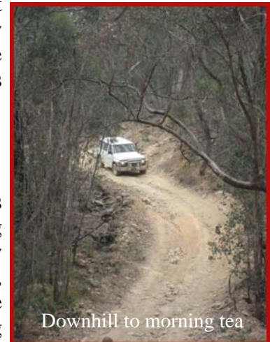
Downhill to morning tea

The first part of the route took us down Radcliffe Track, Blue Gum Track, Blue Gum Link Road, O'Briens Road and Upper Chadwick Track to our much anticipated morning tea destination. It may not sound like many tracks but it took a good 1½ hours. Some steep inclines and declines and very, very deep dried up mud holes slowed the progress somewhat. Isn't it amazing how photos really do not show things as they are. From inside the car this decline was quite steep. Really!!